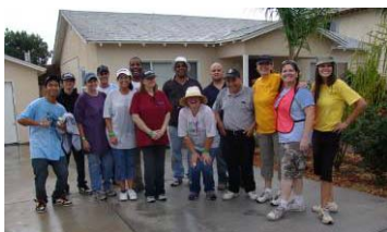
Our work crew, just one of many