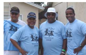
Lend A Hand Day is an ongoing project that we will continue to support in every way possible.