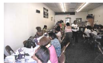
Women enjoying themselves!