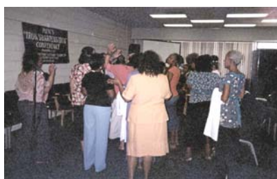
Women ministering at the altar