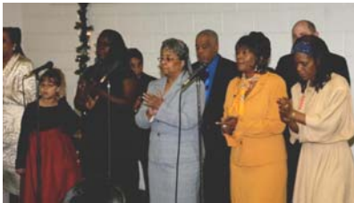
Praise Team glorifying the Lord

We want to thank each of you for your participation and support of our pastor and wife on their 9 th Pastoral Anniversary. It would not have been possible without you! Blessings always!